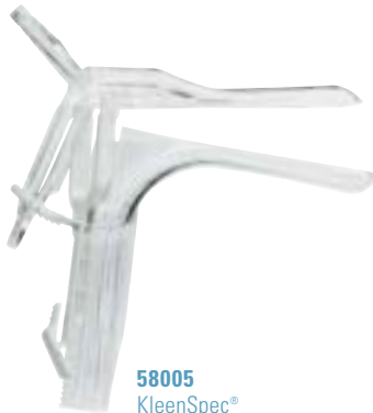
58005 KleenSpec® 580 Series Disposable Vaginal Specula with Smoke Evacuator Tube, Small