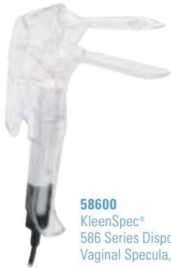
58600 KleenSpec® 586 Series Disposable Vaginal Specula, Small

58006 KleenSpec® 580 Series Disposable Vaginal Specula with Smoke Evacuator Tube, Medium (case of 48)