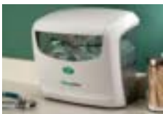
58014 KleenSpec® Storage System

58014 KleenSpec Vaginal Specula Storage Dispenser