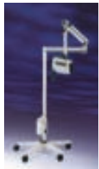
89000A Video Colposcope with Swing Arm