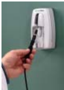
78820 KleenSpec® Illumination Storage System

78600 Expendable Illuminator for Vaginal Specula (6/box, 6 box/case)