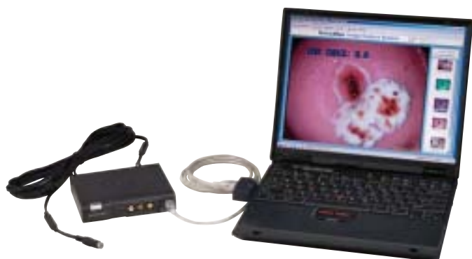
88802 Image Capture System for Laptop PC