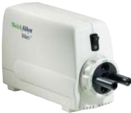
49500TW MFI Solarc Light Source with Turret