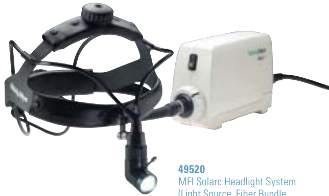
49520 MFI Solarc Headlight System (Light Source, Fiber Bundle, Headband/Luminaire)