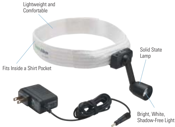
46070 Solid State Portable Headlight with Direct Power Supply/Charger