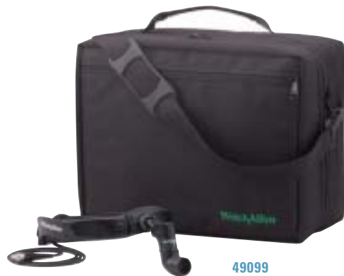
49099 Carrying Case