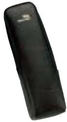
05232-U Soft Carrying Case