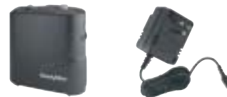
75201 Portable Power Source Only