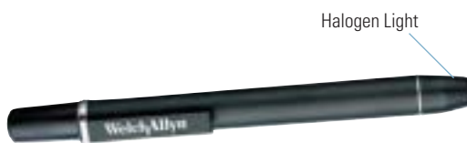
76600 Halogen Professional PenLite