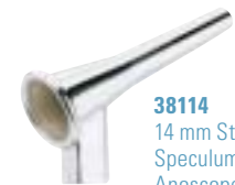
38114 14 mm Standard Speculum Anoscope