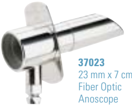
37023 23 mm x 7 cm Fiber Optic Anoscope