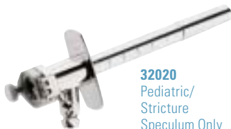
32020 Pediatric/ Stricture Speculum Only