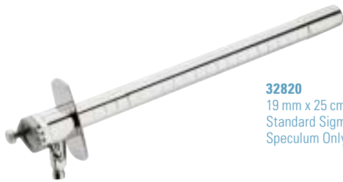
32820 19 mm x 25 cm Standard Sigmoidoscope, Speculum Only with Obturator