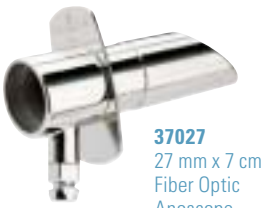
37027 27 mm x 7 cm Fiber Optic Anoscope