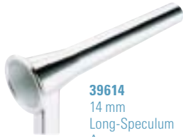
39614 14 mm Long-Speculum Anoscope