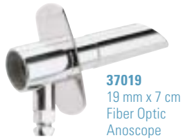
37019 19 mm x 7 cm Fiber Optic Anoscope