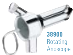
38900 Rotating Anoscope