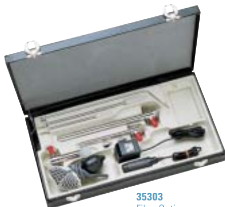
35303 Fiber Optic Sigmoidoscope Set