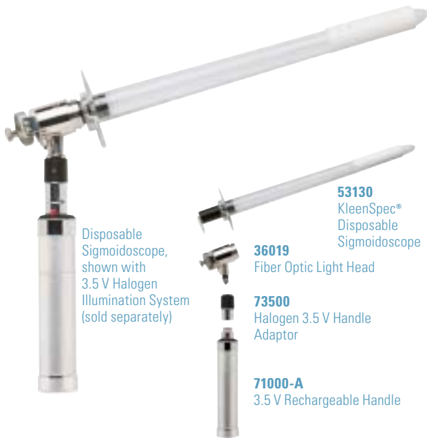
Disposable Sigmoidoscope, shown with 3.5 V Halogen Illumination System (sold separately)