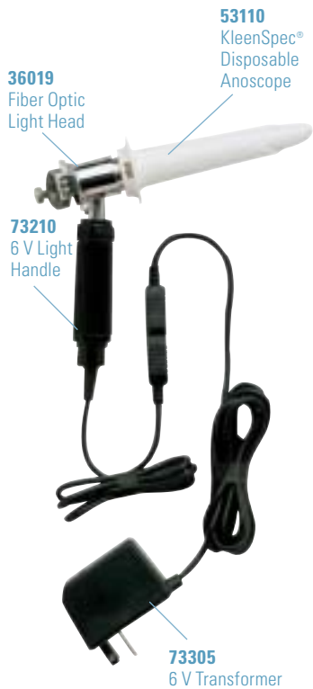
36019 Fiber Optic Light Head