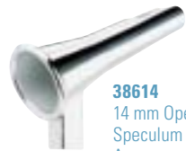
38614 14 mm Operating Speculum Anoscope