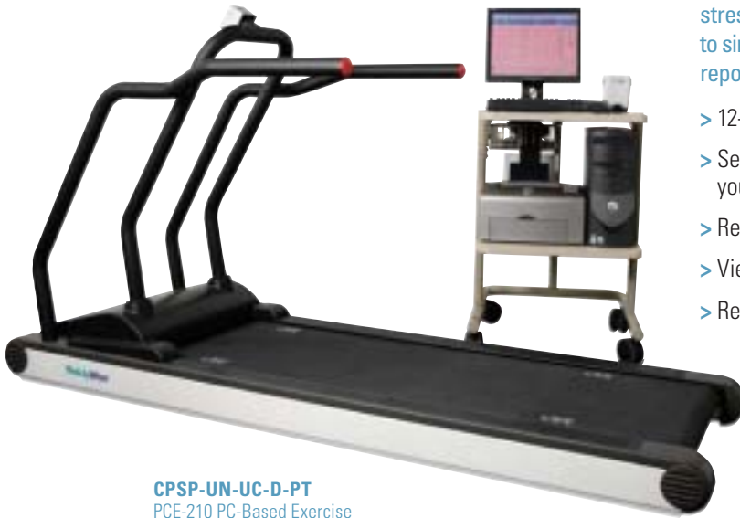
CPSP-UN-UC-D-PT PCE-210 PC-Based Exercise Stress System

Turns any PC into an all-in-one, high-performance, low-cost stress test system. Has everything you need, including the ability to simultaneously monitor 12 leads on screen with programmable reports and protocols.