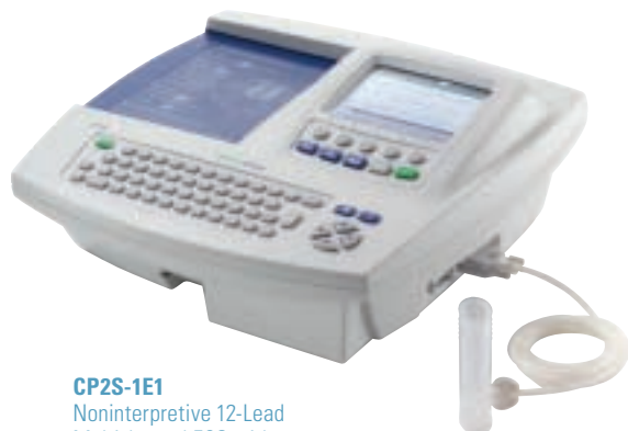
CP2S-1E1 Noninterpretive 12-Lead Multichannel ECG with Spirometry

CP2AS-1E1 Interpretive 12-Lead Multichannel ECG with Spirometry Option