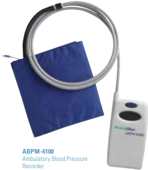
ABPM-6100 Ambulatory Blood Pressure Recorder