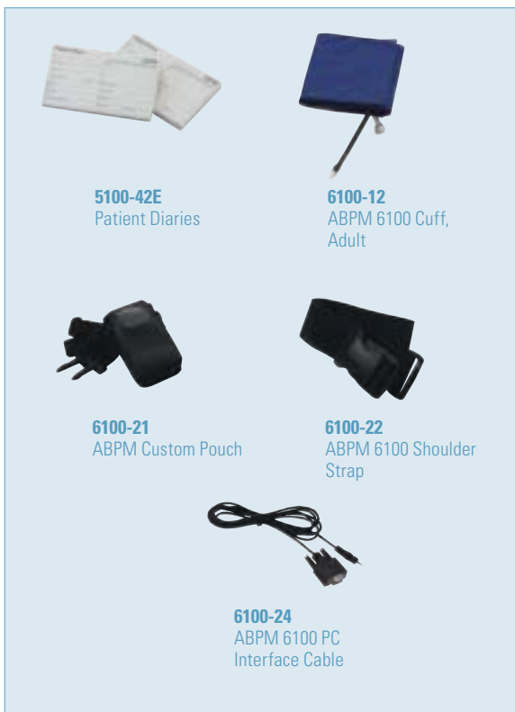
5100-42E Patient Diaries