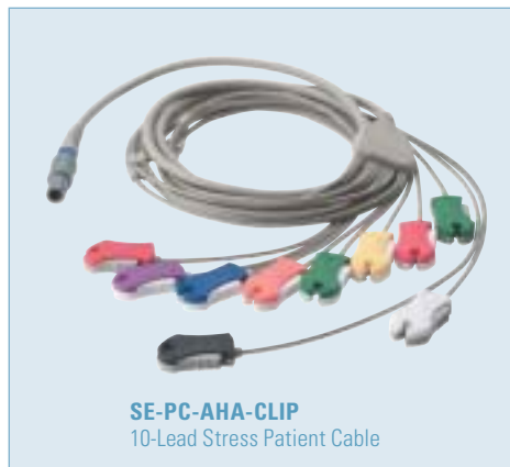
SE-PC-AHA-CLIP 10-Lead Stress Patient Cable

CPSP-UN-UC-D-T PCE-200 PC-Based Exercise Stress System (software only)