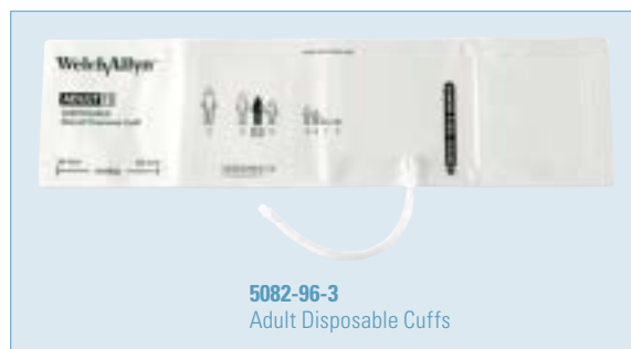
5082-96-3 Adult Disposable Cuffs