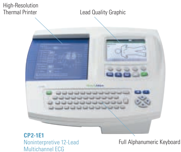
CP2-1E1 Noninterpretive 12-Lead Multichannel ECG